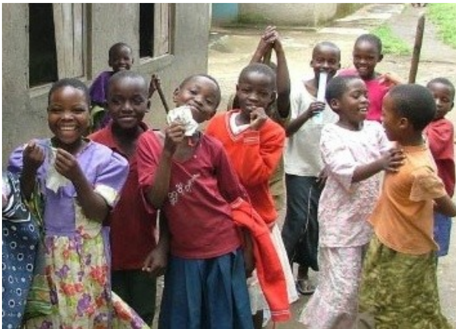
Above: Happy girls, many with disabilities, some blind, at Katumba II school, Tukuyu, Mbeya region.