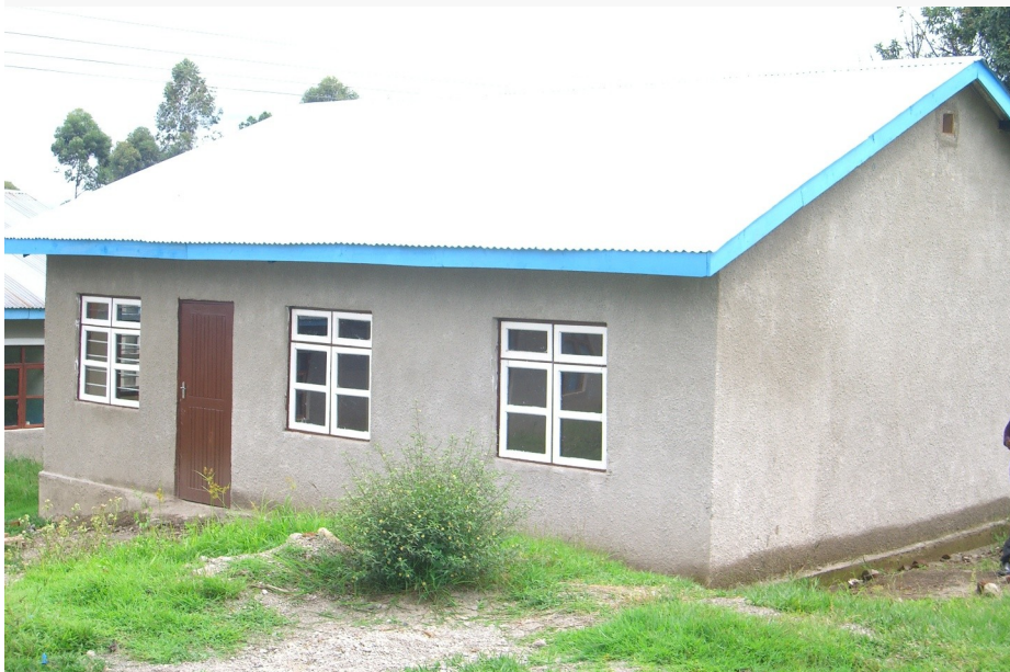
Below: Classroom built by TDT with funds from a generous Trust.