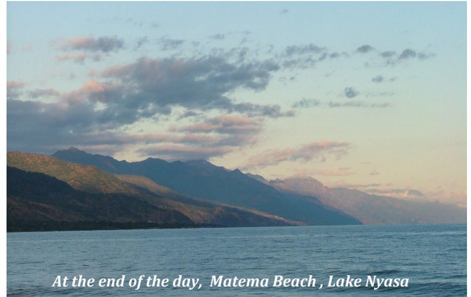
At the end of the day, Matema Beach , Lake Nyasa

Income and Expenditure Statements for the year are at the end of this report.