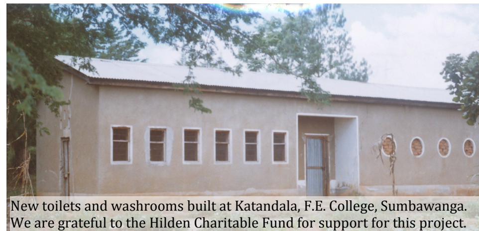
New toilets and washrooms built at Katandala, F.E. College, Sumbawanga. We are grateful to the Hilden Charitable Fund for support for this project.

A new link: a team of teachers and students from Douay Martyrs Secondary School in Hillingdon worked in a school near Sumbawanga, Rukwa Region, last year and will be going again this summer.